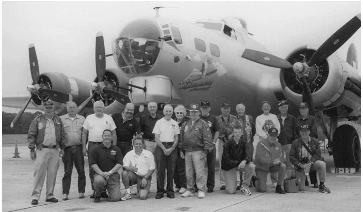
MAAF Museum members take a moment out to pose in front of the B-17 ‘Aluminum Overcast’ along with its pilot, ground crew, and members of the Experimental Aircraft Association (EAA) from Oshkosh, Wisconsin, and local EAA Chapter 216 from Cross Keys, NJ, sponsors of the warbird visit.

In addition to enabling people of all ages to experience first-hand the historic B-17 bomber, the tour and its mission helped increase awareness of the EAA,